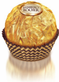
The FERRERO ROCHER® trade-dress is a trademark owned by Ferrero.

often serves the same function as a trademark – identifying the source of products in the marketplace – in some countries it can generally be protected under trademark laws, and in a few countries it can be registered as a trademark. Depending on your country, if trade dress cannot be registered as a trademark, it may nonetheless be protectable under unfair competition laws or actions for passing off.