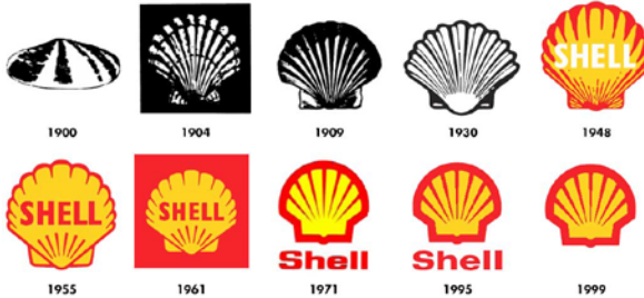
The SHELL® logo is property of the Royal Dutch Shell group of companies.

Many trademarks have changed slightly over the years in order to modernize the image of a business or adapt to new advertising media. You will have to consult with the trademark office(s) concerned or a trademark agent as to whether a specific change will require the submission of a new application and payment of relevant fees.