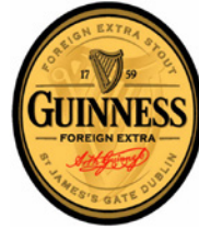
Label for GUINNESS® Foreign Extra Stout by Diageo Ireland.

which charges its operating companies (in high-tax jurisdictions) royalty fees for the use of the trademarks.